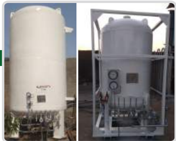
Liquid Argon STORAGE TANK