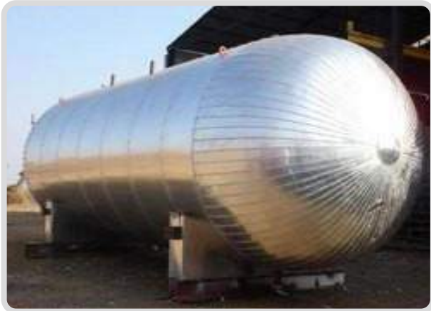
Liquid CO2 STORAGE TANK