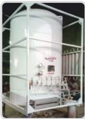
Liquid Nitrogen STORAGE TANK