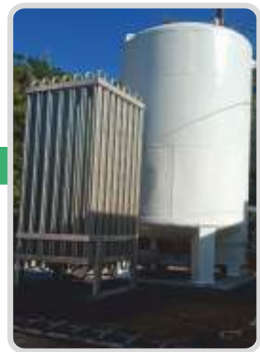
Liquid Oxygen STORAGE TANK